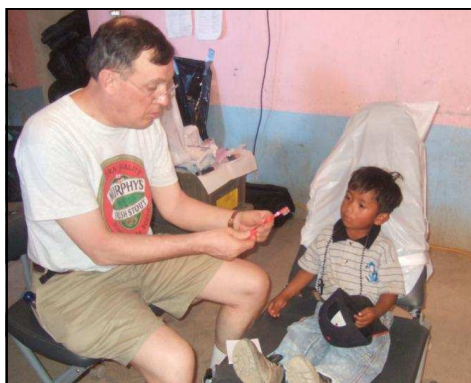
An El Niño Rey volunteer gives a brushing lesson to a young patient.

El Niño Rey is no ordinary service trip. My first experience was in 2003 on a trip for high school students, dur-